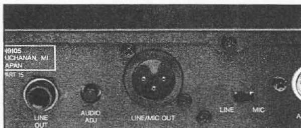
Figure 2 - Connect Audio Cable on Rear Panel